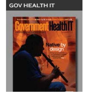
Table of Contents FCW.com Download